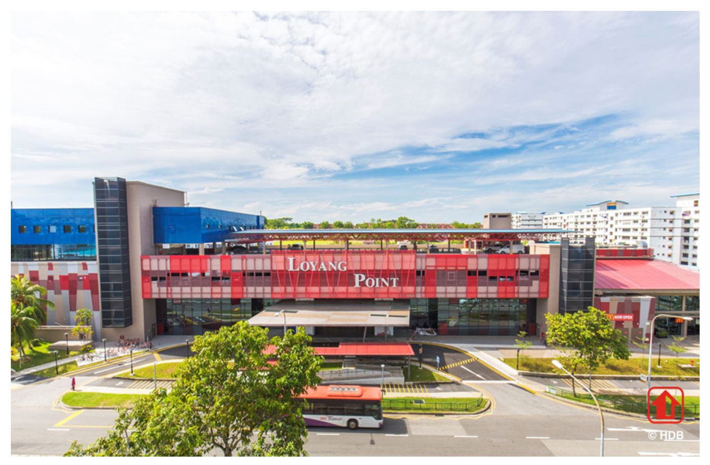
Loyang point has been newly refurbished last year.

The recently refurbished Loyang Point is just a six-minute drive away. The heartland shopping houses Giant and Sheng Siong supermarkets, as well as clinics, hair salons, food courts and fast food restaurants and serves a convenient one-stop-shop for all your daily needs.