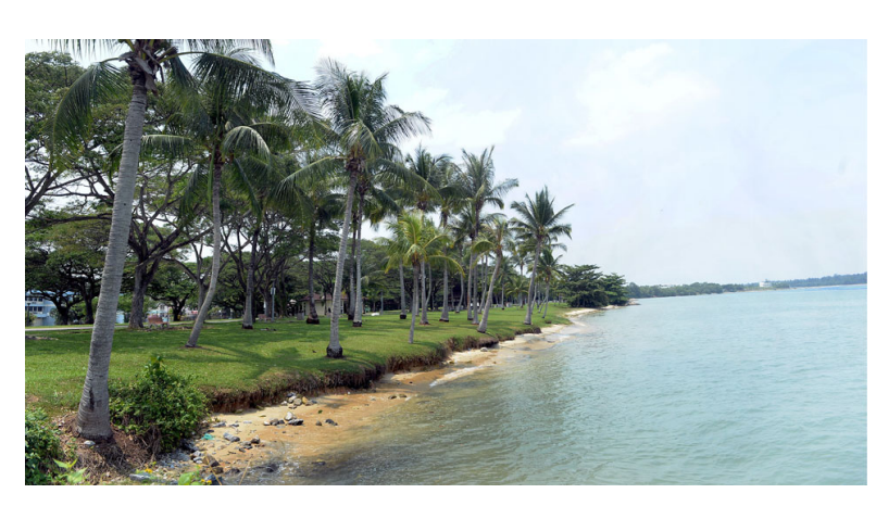
The Pasir Ris Beach is within cycling distance.

In addition, Flora Drive is located near not one, but three beaches, which are all within cycling distance. Take your pick from the fun-filled Pasir Ris Beach, idyllic Changi Beach, or family-friendly East Coast Park.