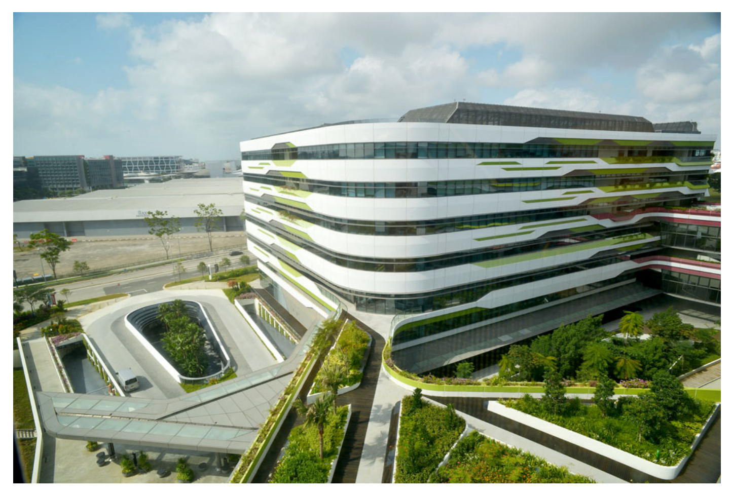
The campus of Singapore University of Technology and Design (SUTD).

The estate is also within walking distance to Tampines Junior College and close to Singapore University of Technology and Design (SUTD). There are plenty of local and international schools such as The Japanese School, Overseas Family School and United World College of South East Asia (UWCSEA) in the east to choose from.