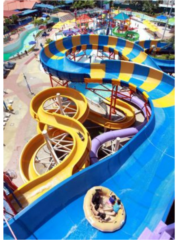
Wild Wild Wet water adventure park offers thrilling water rides.

You won't have to wait for the weekend to head to the beach either. Upcoming condominium The Jovell recreates that beach resort feel at your doorstep, with resort-style facilities such as a 200m continuous waterscape and a beach with textures mimicking a sandy feel underfoot.