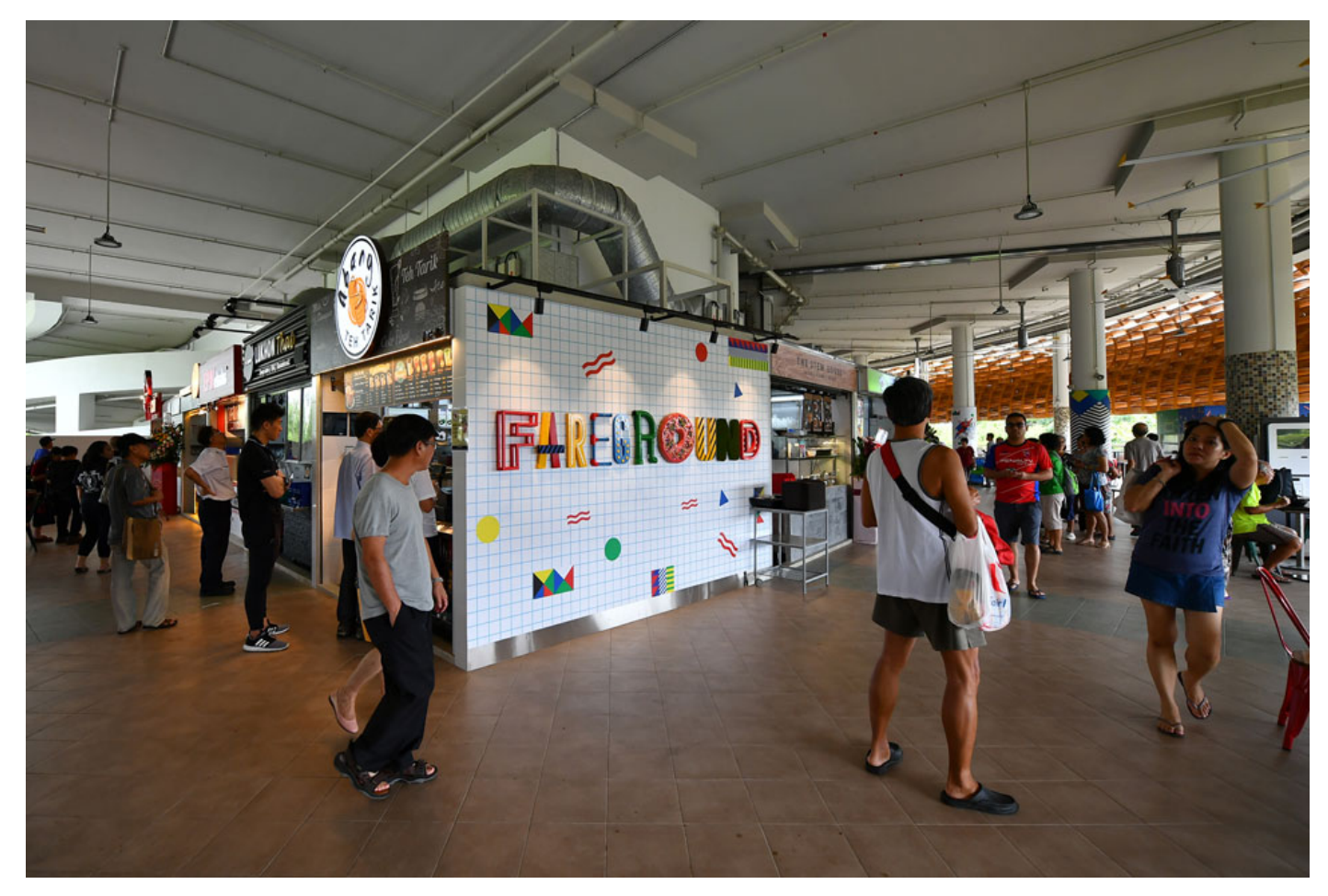
Pasir Ris Central Hawker Centre features old-school dishes as well as international cuisines.

To eat out, visit the brand-new Pasir Ris Central Hawker Centre, where traditional hawker delights sits comfortably alongside the modern. At this two-storey hawker centre, you can find old-school dishes such as carrot cake and ayam penyet, as well as contemporary fare such as burgers, healthy grain bowls and Korean army stew.