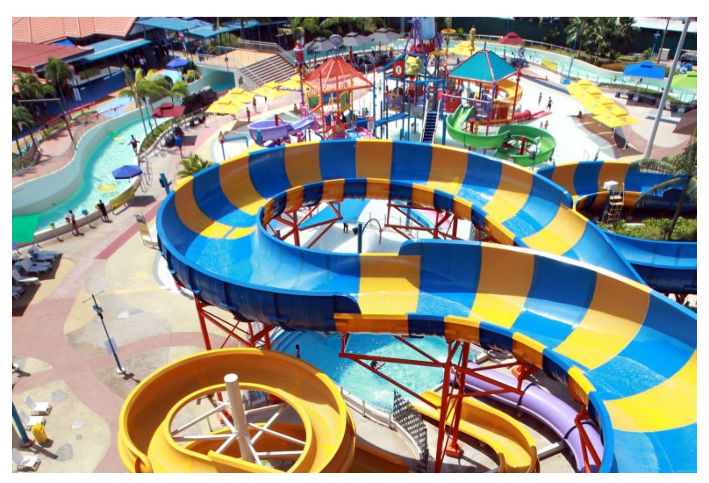
Wild Wild Wet water adventure park nearby offers thrilling water rides.